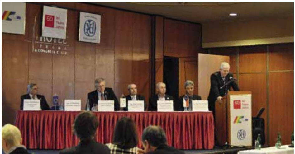
UCMPC national consultation meeting - Prime Minister's speech

Another major event was the national consultation meeting of production co-operatives held on 15 November in Prague attended by 200 representatives of member co-operatives. The main theme of the speech of the UCMPC President JUDr. Rostislav Dvořák was the project of restructuring the economy of the Czech Republic to strengthen the stabilisation of economy and employment through co-operative production enterprises and medium-sized companies. A guest of honour at the national consultation meeting was the Czech Prime Minister Jiří Rusnok.