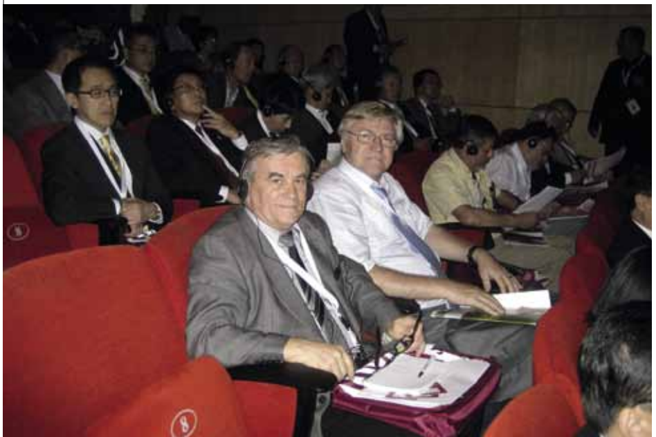
General Assembly of the ICA – Czech delegation

The three workshops of the Global Conference on the Co-operative Decade subsequently resumed their programmes from the previous day (more information follows below).