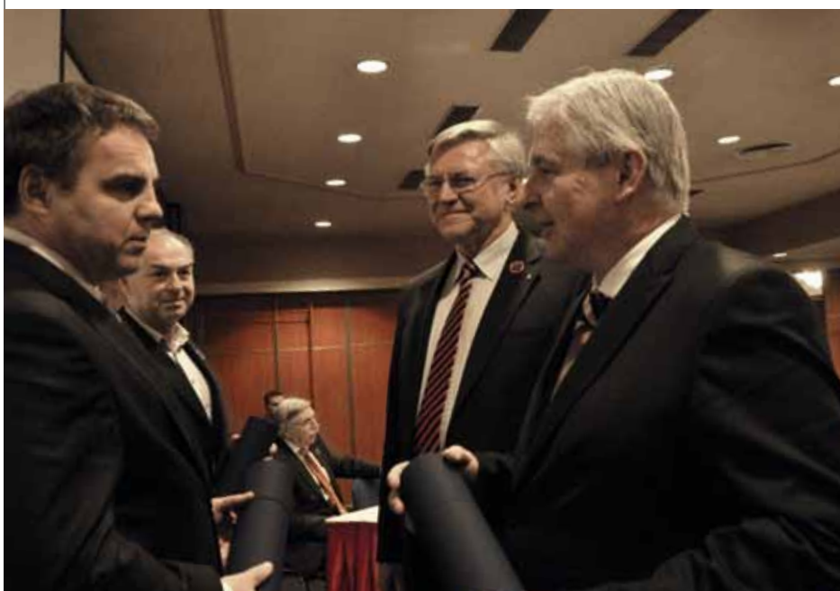
UCMPC national consultation meeting - Prime Minister giving awards.

Another area, which is far more visible and obvious for our members, includes specific educational, advisory, consulting and organisational activities. In the first half of 2013, we planned and carried out more than 20 training events for the employees of member co-operatives, which were attended by over 500 people. The training is based on the information provided to members through the extranet and special information newsletters published up to 20 times a year as needed in paper-based and web-based form. Training topics are permanent, mostly from the legal and tax areas, especially economic, marketing, commercial or ad hoc themes according to current needs. A very topical subject presently is the preparation of new model statutes for co-operatives. The second half of this year will be focused specifically on training and seminars on this issue so that the member