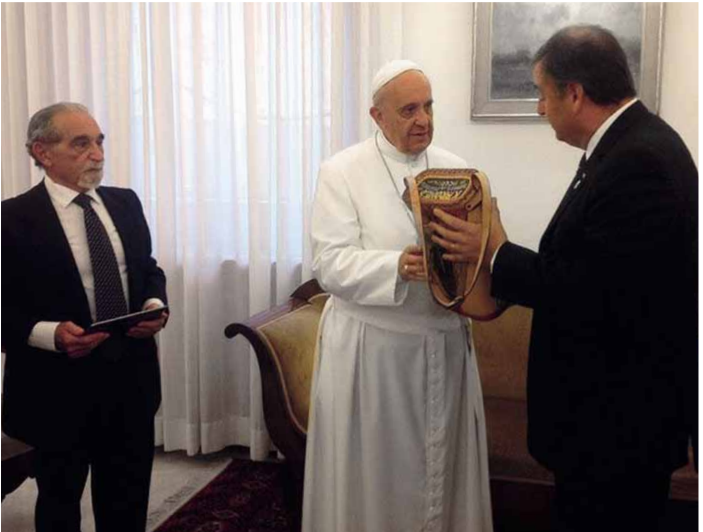
The Pope receiving a gift

During the reception, Pope Francis expressed his support for co-operatives, which he perceives as a crucial element of the world economy in the future. He mentioned their role in the current economic crisis, when people are dying of hunger and cold and when even in countries perceived as highly developed, such as Spain and Italy, the youth unemployment rate reaches 40%. He noted his father, who already in 1945 discussed the impact of co-operatives on local communities.