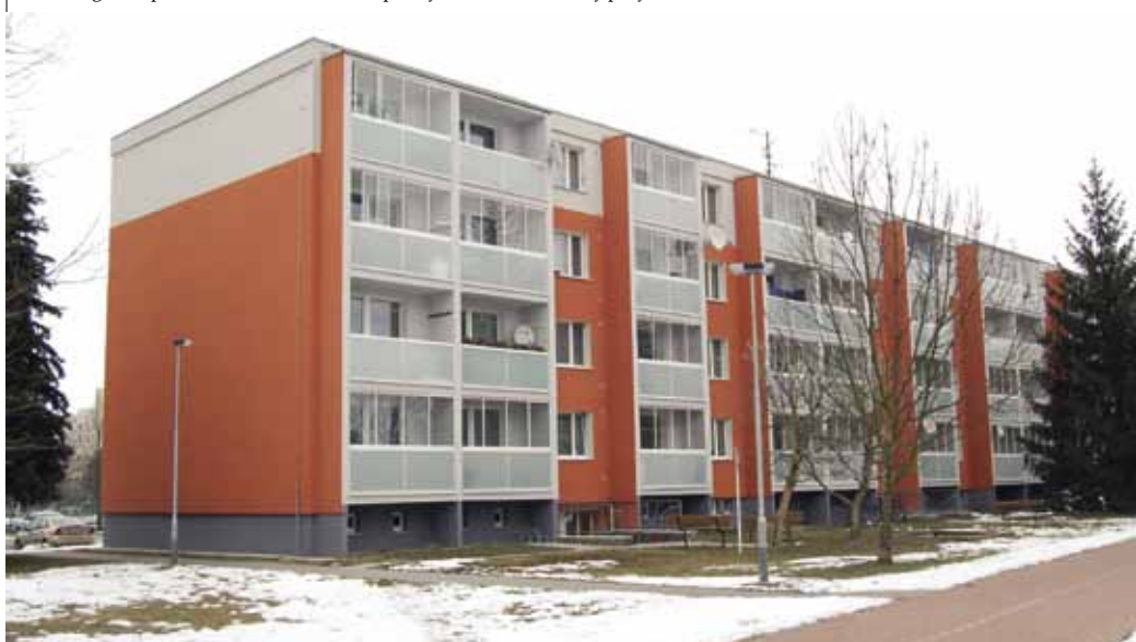
Housing Co-operative Olomouc: Example of modernisation of prefabricated houses

We estimate that, together with the completion of the 1st stage of repairs and modernisation of the apartment houses, it is realistically possible to expect the need for work amounting to CZK 190-270 billion. Whether these activities will be actually carried out will depend not only on the financial situation, needs and knowledge of the owners and users of the flats, but also on the economic situation of the state in the coming years and on its willingness to support such measures. Experience with the past or existing subsidy programmes has confirmed that the state's participation in a reasonable and long-term subsidy programme can significantly raise interest of the citizens in the particular subject. From the perspective of the state, it is then possible to expect great results for a relatively low cost.