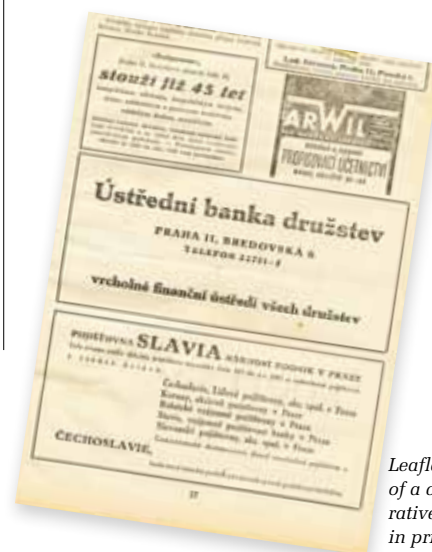
Leaflet of a co-operative bank in print

Based on the documentation of the Museum of the Co-operative Movement and the following publication: Juřík, Pavel, Historie banka spořitelén v Čechách a na Moravě (The History of Banks and Savings Banks in Bohemia and Moravia), Libri, Prague 2011.